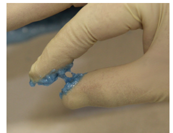
Performing the string-time test