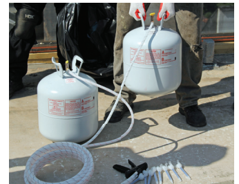
Shaking of A-side and B-side tanks