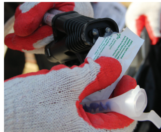
Application of petroleum jelly to spray gun