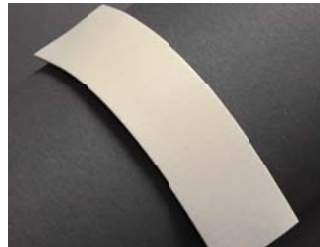
Carlisle Sure-Weld TPO – 60 Weeks (No Failure)