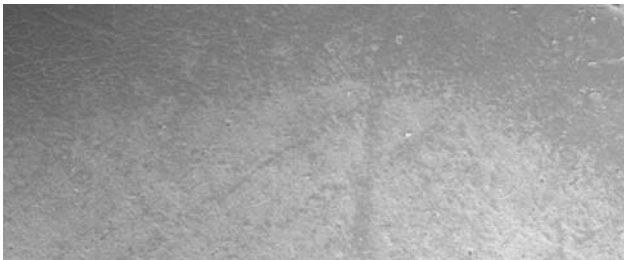
Carlisle Sure-Weld TPO with OctaGuard XT

TPO membrane samples from four manufacturers, including Carlisle, were recently subjected to accelerated heat aging in a controlled, 275°F environment. Heat aging accelerates the impact that heat plays on TPO and evaluates its performance on the roof. Samples were removed when they showed signs of cracking, or were deemed not suitable to perform as a waterproofing membrane. Extreme Xenon Arc Weatherometer testing also reveals that Sure-Weld TPO can withstand twice the ASTM D6878 requirement of 10,080 kJ/m 2 without losing its desired physical properties.