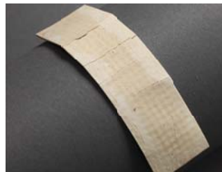
“Competitor C” TPO – 37 Weeks