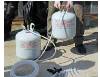
Shaking of A-side and B-side tanks