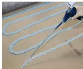
Apply using extension nozzle