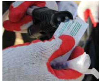
Application of petroleum jelly to spray gun